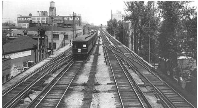
A southbound Jackson Park train of 1200-series wooden cars passes through Granville Interlocking in this view looking north from Granville station. The section of the North Side Main Line between Wilson and Howard was expanded into a four-track line when it was elevated onto a solid-fill embankment.

As noted above, when the North Side Main Line entered service in 1900 under the Northwestern Elevated Railroad, it was able to operate separated express and local service. This is evident north of Armitage, where some stations have dual side platforms on the outside of the outer two tracks, while others have dual island platforms between the inner and outer tracks. Originally, the former served the locals (which ran on the outside tracks) and the latter served expresses. Today, the formers serve the Brown Line (south of Clark Junction), while the Red Line has taken the place of the expresses. The headhouses in this stretch were all largely the same, designed by architect William Gibb in an Italianate-influenced Neoclassical style, while the platforms had hipped-roof canopies with intricate latticed ironwork typical of the Victorian industrial construction of the period. The Diversey stop is representative of these stations.