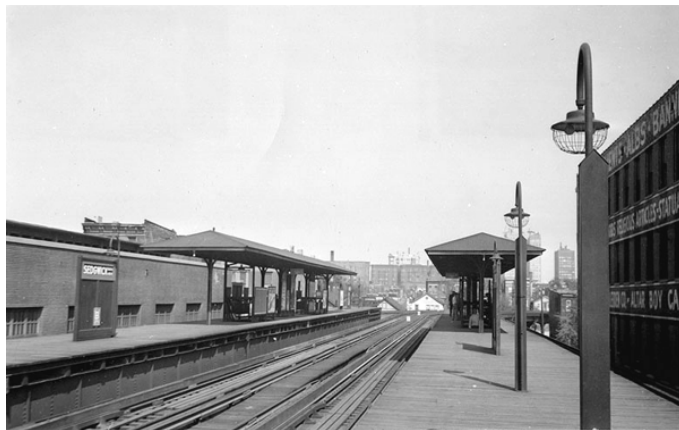
The Sedgwick station, seen here in May 1955, is typical of the Northwestern Elevated's original dual-island platform express/local stations. This view looks east on the inbound platform. The station is still in use, although the outside tracks are out of service, so it functions more or less as a local stop.

The route went through a number of growing communities with many potential "L" passengers, though the area