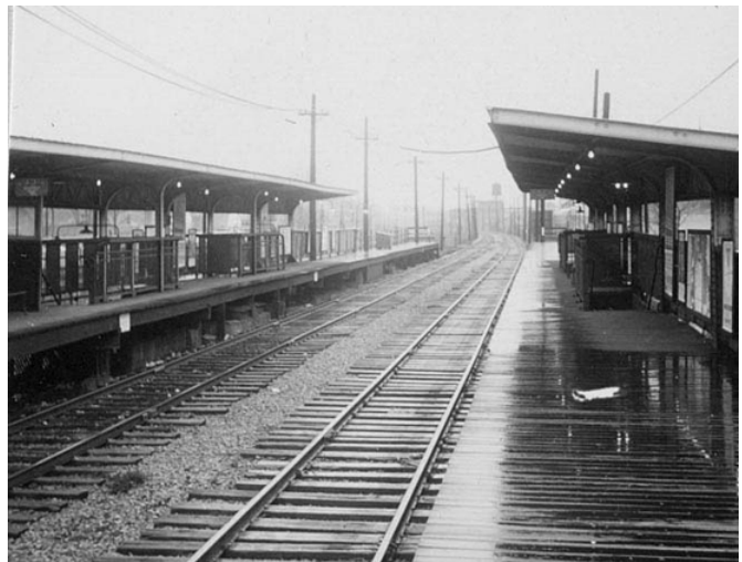
This view looking north from Dempster station after a spring rain on May 1, 1964 shows the typical environment of the Evanston Line in south Evanston, which was elevated in 1908-10. The city has a relatively high density here, but the openness still conveys a bucolic suburban setting.

The rest of the Evanston Line from downtown to Central Avenue was also eventually elevated starting in the late 1920s. Work was slow and was not completed until 1931. A permanent station house and platform was built at this time at Central, though Noyes and Foster got only permanent platforms with temporary station houses. Although station houses were designed, they have yet to be built. In the same year, a new station opened at South Boulevard, executed in the same Beaux-Arts style designed by Arthur Gerber at Central on the same line, replacing the station at Calvary.