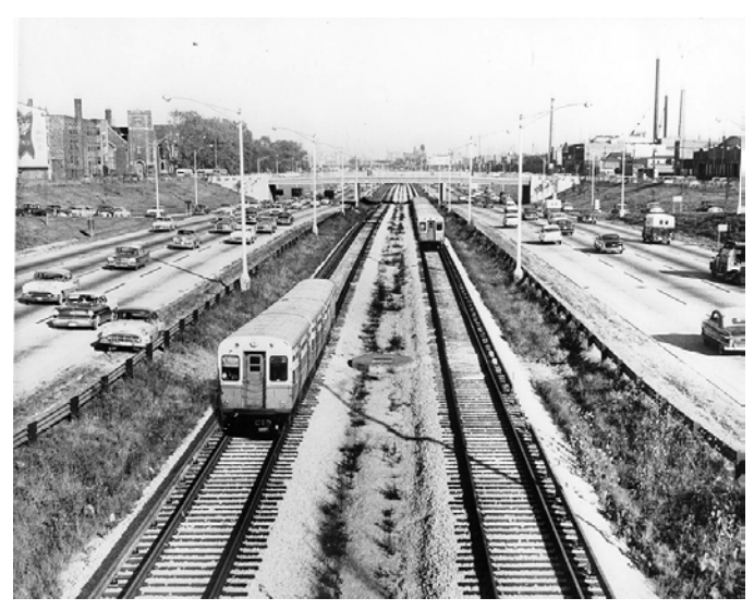
gress Line on October 9, 1957, eight and a half months before median of the expressway, was 600 feet long (long the line would open for service. Upon opening, only 6000s, the enough, in theory, to accommodate a 12-car train) and system's newest equipment, was regularly operated on the CTA's covered by a canopy for its entire length. The stations new showcase route.

apart, but with station houses and access ramps from both streets. (More minor stations had access from only one street.) What this effectively did was to cut the number of station stops, speeding trains along the route by making fewer stops, while providing almost the same number of entrance points. The Garfield Park branch had 27 stations between the Loop and Desplaines before construction began; the Congress Line, on the other hand, had 24 station entrances, but only 14 station stops. This idea of beginning to space stations farther apart and allowing the bus system to service the areas in between and feed the rapid transit stations represented a new benchmark in station design philosophy and would drive CTA station design into the 21st century.