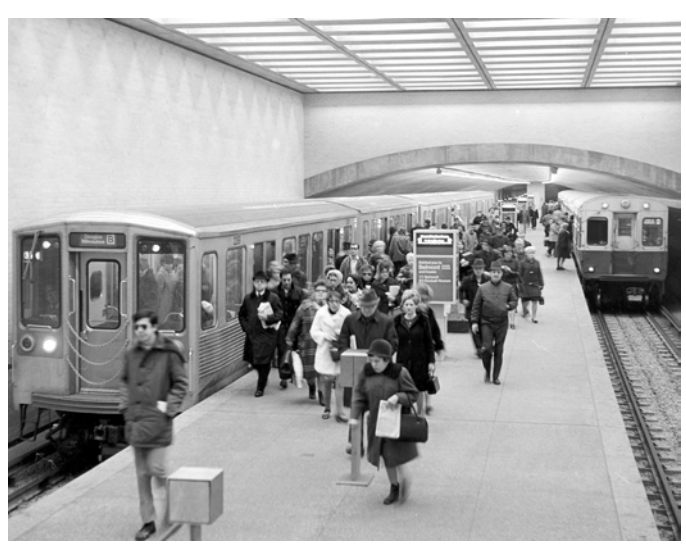
buildings to the agents' booths, to the trashcans, in 1970, it was operated with a mix of purpose-built 2200-series cars (at followed together into a seamless design philosophy, left) and 6000-series PCC cars (at right). Here, a rush hour crowd alights which perfectly captured the boxy, purely functional at Belmont station on March 30, 1970.

The design of the six stations of the Kennedy extension was carried out by Skidmore, Owings & Merrill under the direction of Myron Goldsmith, who developed a modern, functional form in the late International style popular at the time. Improved visibility and security, ease of cleaning and more comfortable working conditions for CTA employees were design goals. Skidmore took the Kennedy-Dan Ryan ("KDR") project in a unique direction, designing all aspects of the new lines to harmonize in both shapes and materials. All windbreaks, dividers, and ticket booths were stainless steel. The formal and functional criteria were expressed in several ways: open, uncluttered, brightly lit interior spaces; durability, safety, maximum efficiency of movement; lightness and purity of structure. The shape of everything, from the When the Kennedy extension and Milwaukee-Klmball Subway opened International Modern style for which Skidmore is so well known.