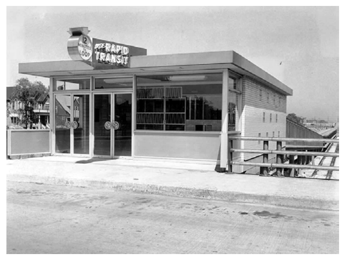
panels alternated with ventilation louvers. This glass month before entering service, was typical of the 1958 Congress was later removed, effectively making the ramps open Line station. Note the neon entrance sign and signature door handles.

Recalling that the platform is set between two streets a quarter mile apart in many cases, there was a rather long distance that needed to be traversed between the station houses and the platforms in between. In nearly all cases on the Congress, this was achieved using long, enclosed ramps from the back of the station house to the end of the platform. Effectively, the passenger had to walk the distance of nearly a city block down this ramp to get from the station house to the platform, though the effect of this was somewhat nullified by the psychological "trick" of it being within the station facility, often causing this walking time to be omitted from the subconscious calculation of how long it takes to get to "the station." These ramps were originally fully enclosed by corrugated green glass The Keeler entrance to Pulaski station, seen on May 23, 1958 a to the air and noise of the surrounding expressway.